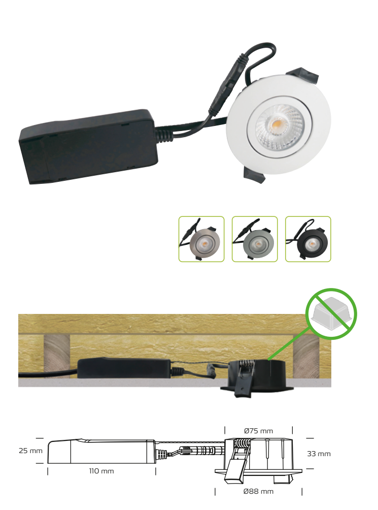
*The drawing is not drawn to scale