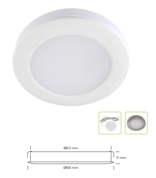
*The drawing is not drawn to scale